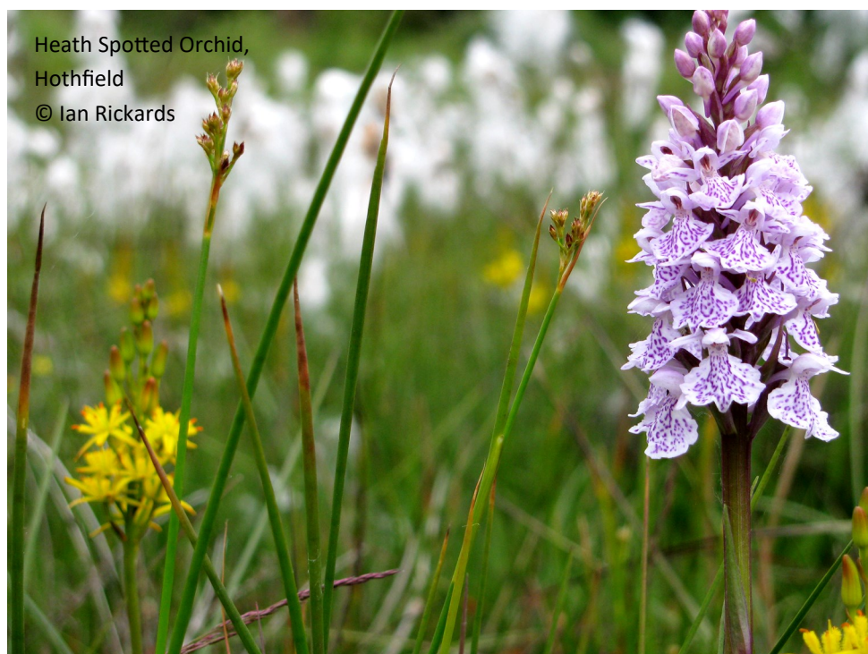
Heath Spotted Orchid, Hothfield