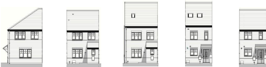
Fernlee 2bed(4) Ripon 2bed (12) Saltaire 3 bed(6) Eastburn 2bed(22) Denby 1bed(6)

It closes the principal route into the village creating a diversion through a badly designed dense and ugly housing estate with parking areas and the smaller most 'boring' houses being faced first (the larger ones being in the extremities of the site).