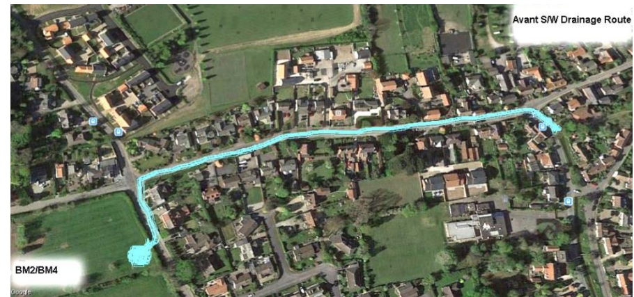
THE BECK, WHERE IT FLOODS, WILL TAKE NEW EXCESS WATER

Avant had some new proposals rejected regarding shifting the surface water. They have been advised to revert back to an earlier Alfa plan – a new pipe down Hungate, discharging into the Beck by the Bus Stop. This is at the heart of flooding in the village - we continue to strongly object to this plan.