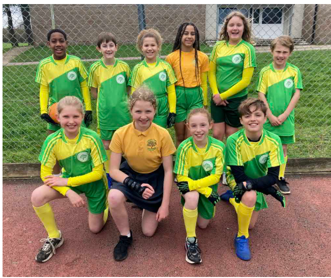
Park. We played St Johns and Ruckstall among others.

The team showed amazing team spirit and supported each other throughout the afternoon.