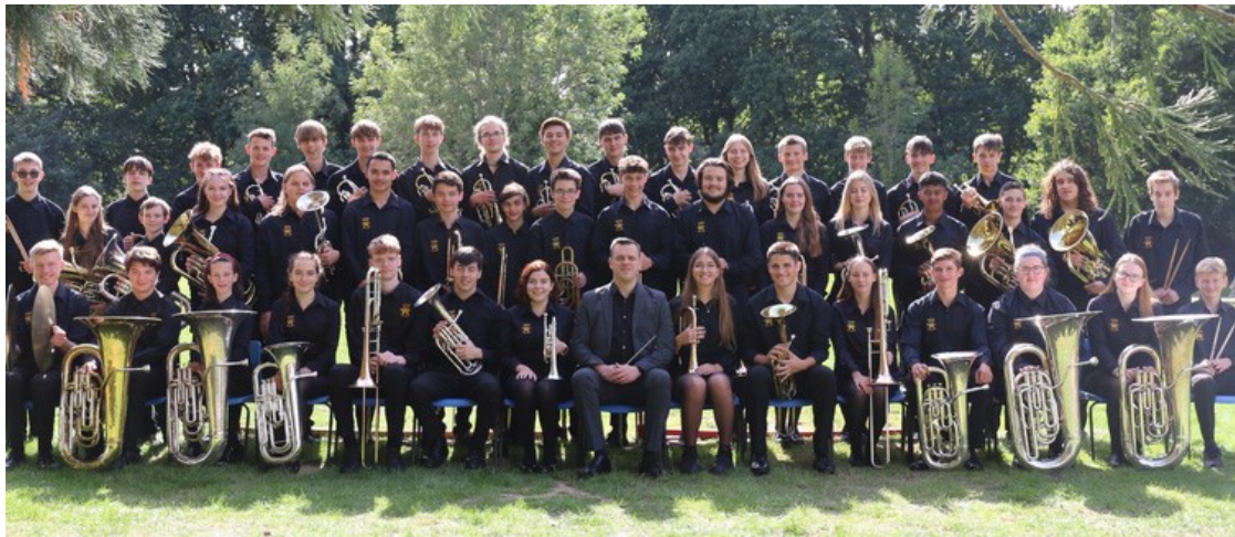
Hampshire Youth Band