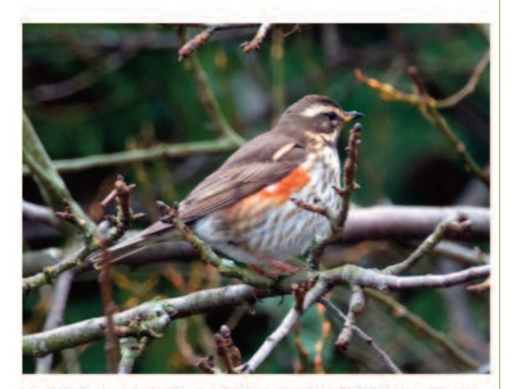
Redwings are winter visitors to the UK. Let us know when your see your first arrival.

Your records are an invaluable source of information for researchers across the world trying to understand the impact of climate change.