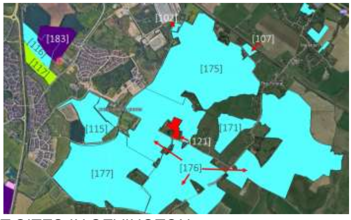
DEVELOPMENT SITES IN SEVINGTON