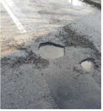
Belmont Road (ref 787334)

I have reported the following potholes, the Highways reference are included.