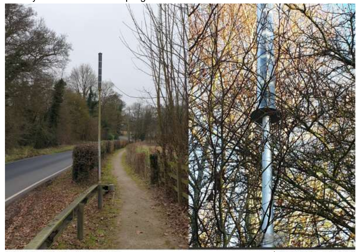
New House Lane / The Street, Mersham

I have asked KCC to look into the replacement or repair of a number of solar lights across the Borough that are not working. I have reported the following so they are included in the programme.