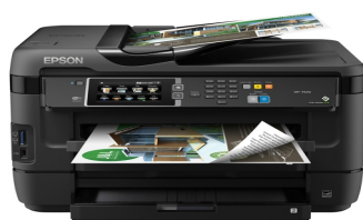
In Harby Village Hall.

Scan, print and laminate documents and posters up to size A3 from just 5p a page.