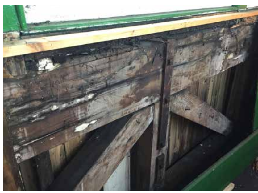
The bridge frame exposed during the inspection

Our current estimate for the works is £500k, but in order to break the project up into more achievable targets, we have created three phases: Rescue, Refurb, Restore . The following pages outline these phases in more detail.