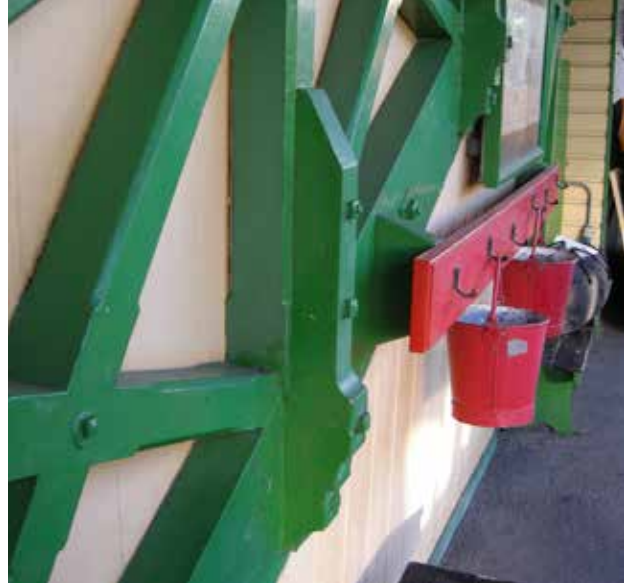
The shaped wooden brackets, platform 3

The advantage of the bridge section being on show whilst under restoration is that it will increase people's awareness of the project, both for passers-by, and for those looking at our website and Facebook page.