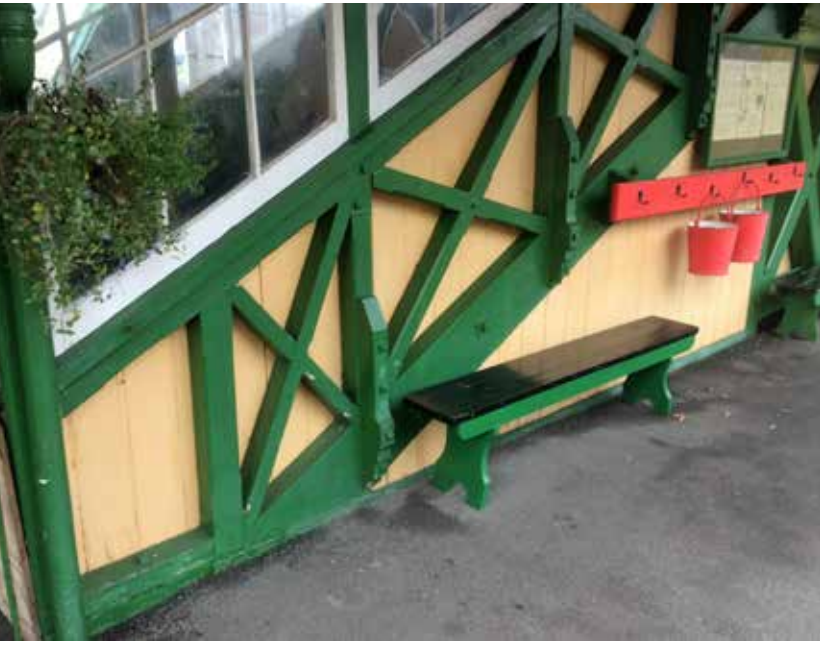
The original design of the bridge exterior, visible on platform 3