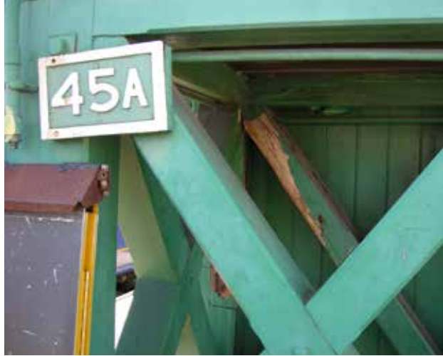
Rot visible in trestle legs on platform 1