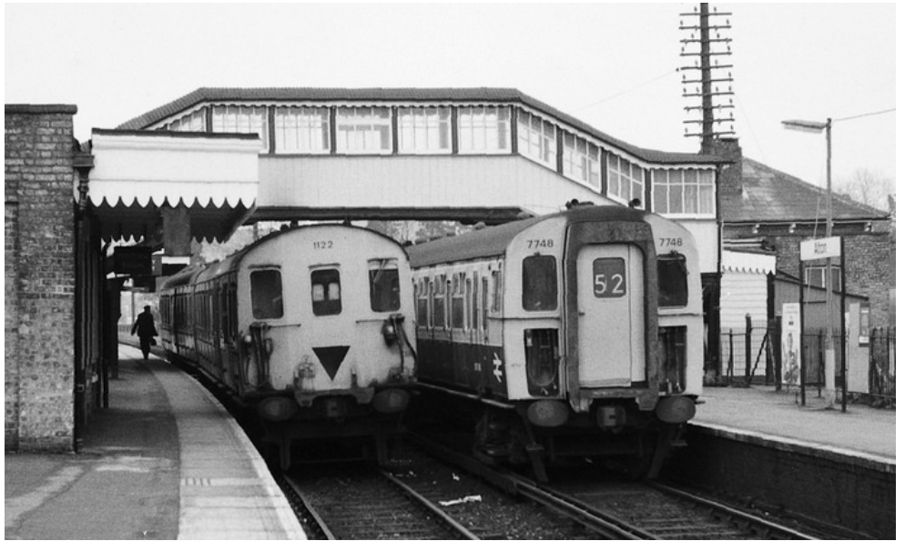
Alton station in the 1980s

Its position as an integral part of the station buildings means that its removal would tear the heart out of this iconic Victorian station. Mid-Hants Railway, The operating from platform 3, benefits from the fact that Alton station, complete with its footbridge, adds to the atmosphere. We want to preserve this structure aenerations for future Victorian to enjoy the craftsmanship.