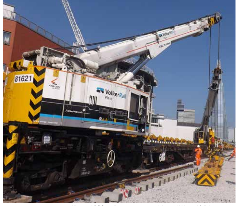
Kirow 1200 rail crane, capable of lifting 125 tonnes. Operated by Volker Rail

This phase will start with us taking ownership of the footbridge and whilst we hope the sale price will be nominal, the legal fees may add to our costs. Once we have ownership, we will commission a measured survey of the bridge and its intended temporary resting place. We will need to have a "cat's cradle" lifting frame (pictured on front cover) manufactured and hire