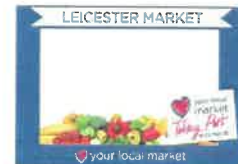
Selfie - board