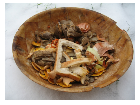
Composting produces rich soil for plants