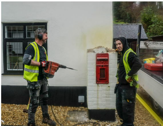
Removal of the old village post box underway