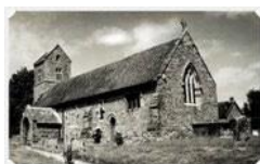
Claydon with Clattercote