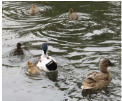
Mallards with ducklings

An ancient alder tree with eleven trunks on the bank of a stream in Pamber Forest caught our attention. All the trunks were dead and rotting with sheets of bark loosening and falling away. While the tree was dead it hosted a veritable city populated with countless tiny invertebrates sheltered by the bark and living off the decaying wood or each other. Hundreds of little holes peppered the bark where a variety of beaks had foraged for a meal, a great example of natural recycling.