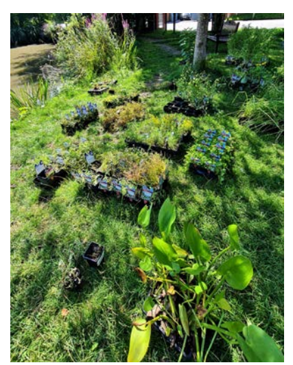
Plants at the ready