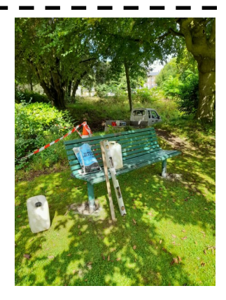
Working on the Peace Garden and the first bench installed.