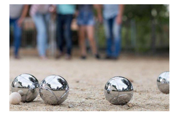
Including Juniors competition.