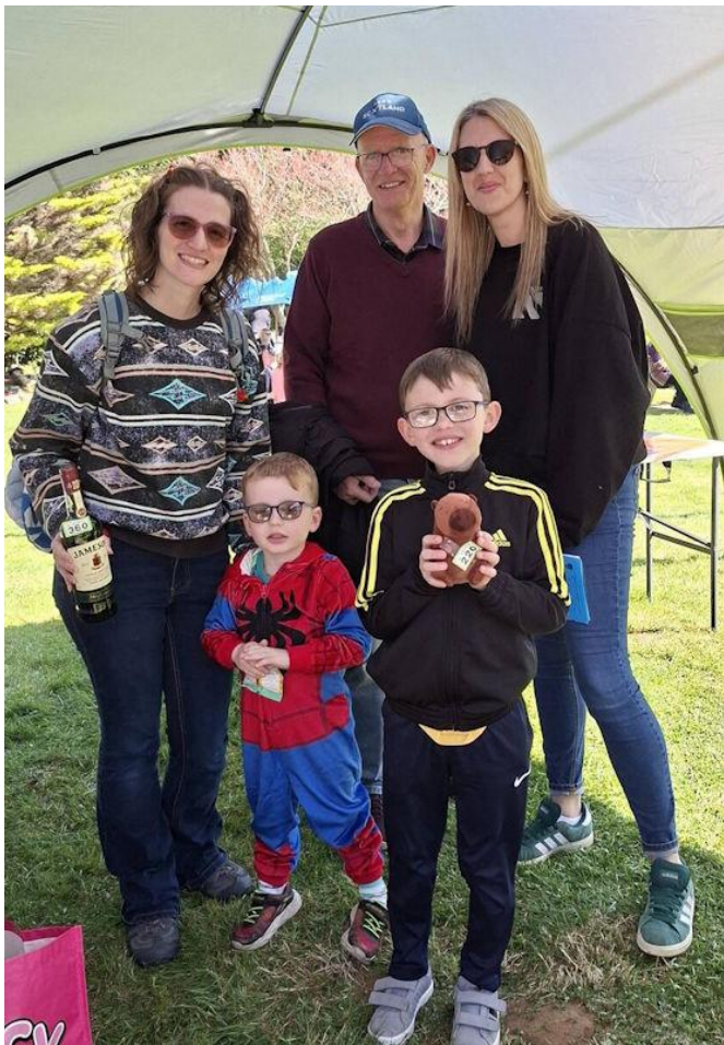
These included a bottle of rum, a bottle of whisky, a Griffin family meal voucher, and various other goodies generously donated by local businesses and friends of Godshill Matters.