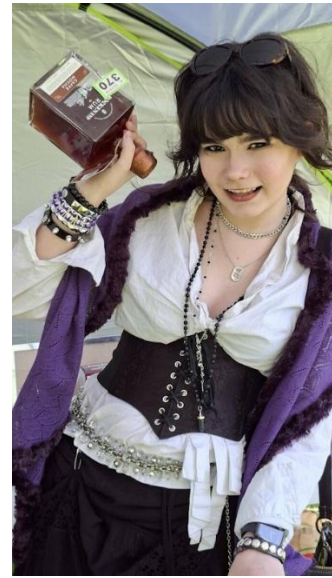
The event was further enlivened by live entertainment from the Sea Gels Shanty Band, as the sun shone all afternoon.