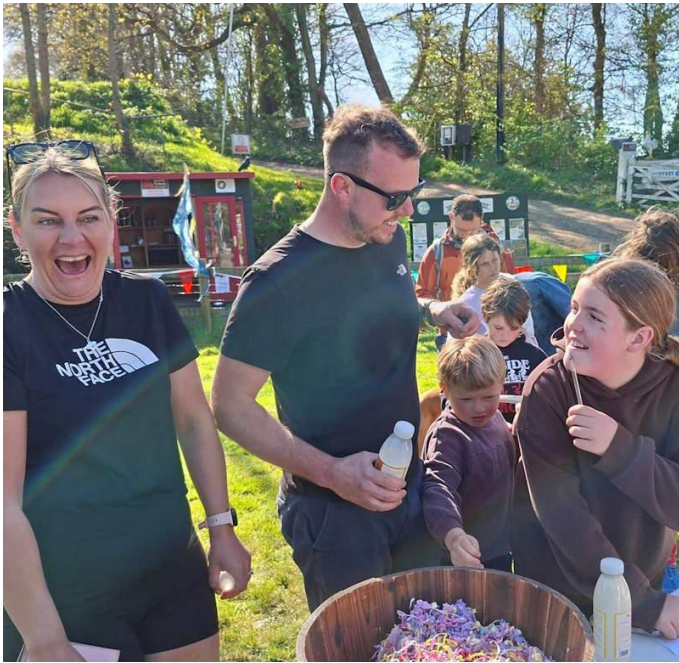
Young adventurers who completed the trail enjoyed a free lucky dip, while adults had the opportunity to participate in a tombola featuring a range of prizes.