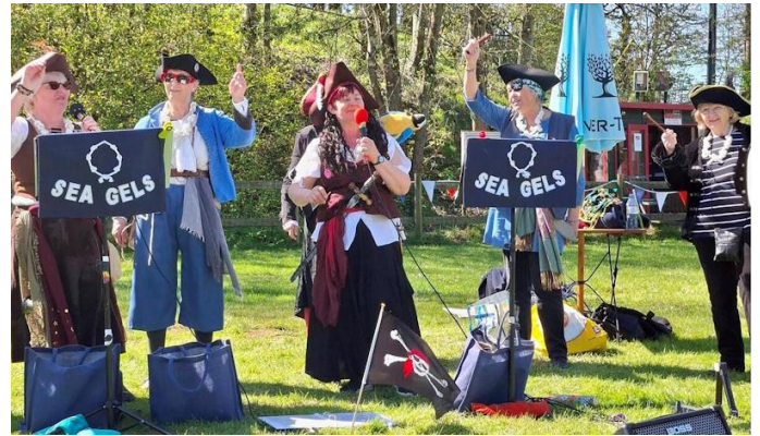
The event raised an impressive £285 for Godshill Matters. A heartfelt thank you goes out to all the individuals and local businesses who donated prizes, ensuring the success of the Treasure Trail. Their support made the day possible and contributed greatly to the community spirit.