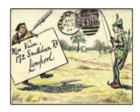
His style and, at times, humour, was also in his letters from the Somme in 1916, where he was a chaplain with the Durham Light Infantry. These are held in te Imperial War Museum.