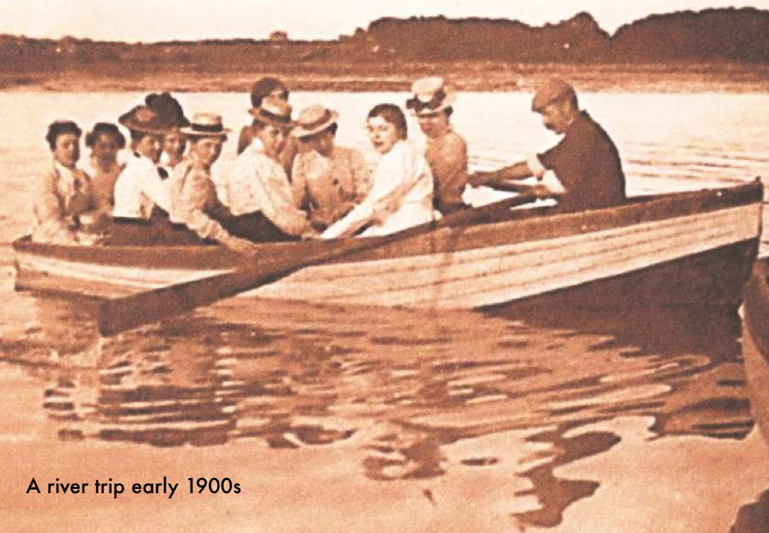
A river trip early 1900s