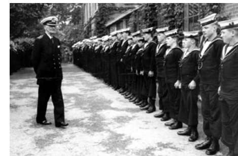
CB Fry inspecting laces, during his last inspection in 1950.

I once went into a room in the Captain's House where there were racks holding dozens of old, wood-wormed cricket bats. Most of them were labelled to show they had been used by CB Fry to make large