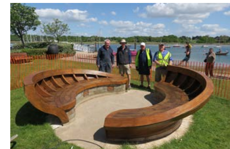
The finished result

The monthly tasks are now focused on repairing the Common's paths damaged by one of our wetter winters. The paths are vital for those of restricted mobility who otherwise would have to forgo the attractions of the Common. Repair involves moving large quantities of gravel by