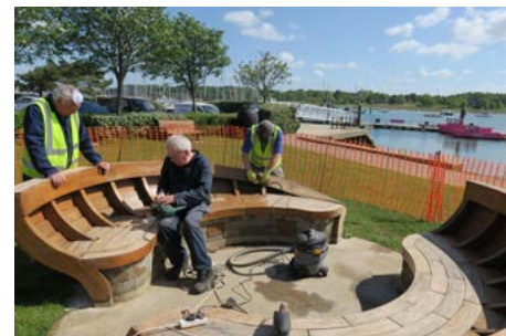
HCVs working on Foreshore seating

One of the attractions of the Hamble foreshore is the circular seat modelled on the design of a clinker boat. Sited near the lifeboat station, it was designed by the famed wood sculptor Tim Norris and is unusual in that it looks eye catching and yet is a popular and comfortable seat.