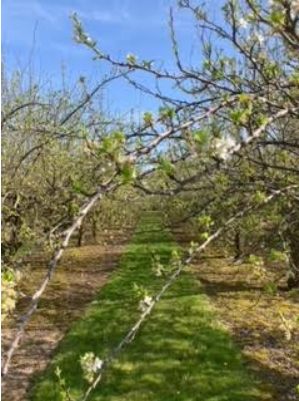
Fruit trees at Elm Farm