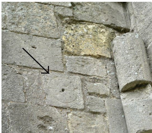
Romsey Mass dial ext east wall

R eturn by way of All Saints' Church, Houghton, where you will find another fine example on the south wall of the nave. Passing through Romsey and having 'got your eye in', see if you can find the mass dial, again re-used and in an unsuitable place for its purpose, on the east face of the Abbey. Look about twelve feet up on the north side of the south-east buttress (see photo with dial arrowed). It's a challenge to find it but once you see it (level with a small section of rounded pilaster in the nearby angle) it is quite clear. Presumably it was once on the south wall of the now-demolished Lady Chapel.