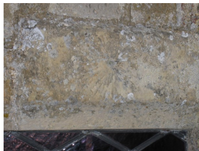
Kings Somborne Better Dial

C ontinue up the Stockbridge road and stop next at St Peter and St Paul, Kings Somborne . This time you need to walk around the right hand end of the church and, along the rear south-facing wall, look at the third window along. Here you will find two clearly-defined scratch dials, with the central holes easily visible. They seem to be upside down, so must have been re-positioned at some time after they became obsolete.