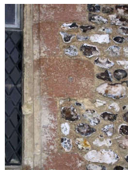
Stockbridge parish church mass dial

was built in Victorian times, which is why it has been placed where little sun is likely to reach it.