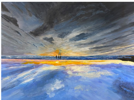
Beach Sunset Acrylics Hilary