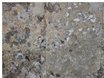
Timsbury mass dial

Start at Timsbury. As you follow the path round towards the door of St Andrew's Church, you will find a rather faint dial scratched on the south face of a south-east corner stone, about four feet from the ground.