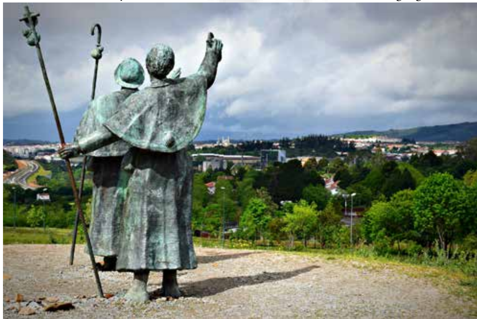
The Pilgrims statue near Santiago De Compostela