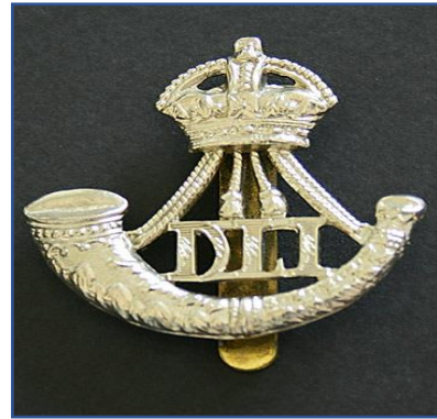
Above: Cap badge of the Durham Light Infantry Reproduced with the permission of the Trustees of the Former Durham Light Infantry Regiment and the DLI Collection