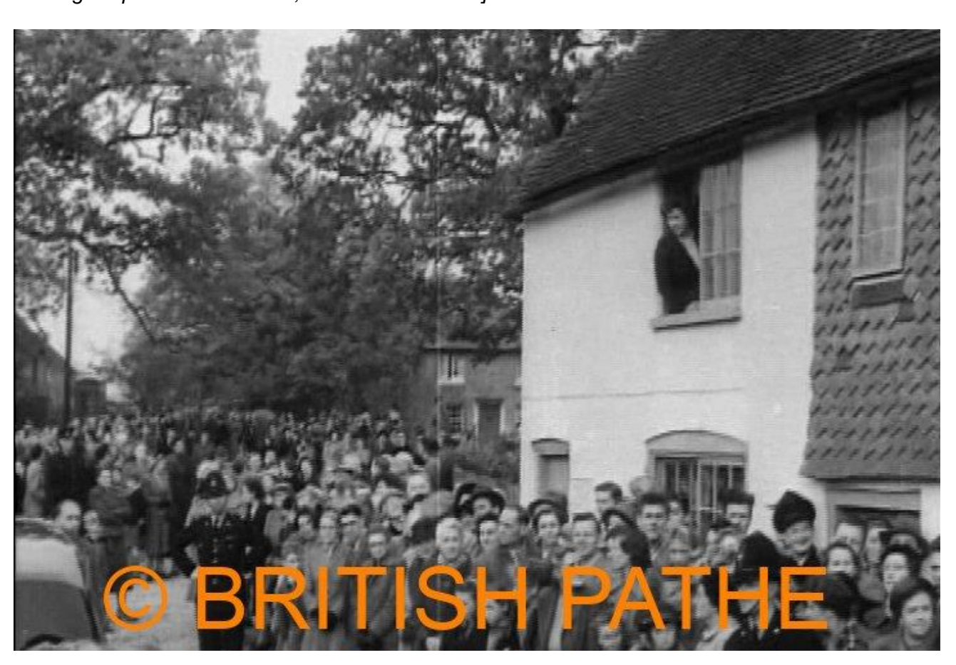
Video of the event - <a href="https://www.youtube.com/watch?v=-Z8hXB1J0pw">https://www.youtube.com/watch?v=-Z8hXB1J0pw</a>

[Editor's note: the first nine houses on the north side of Church Close had been completed by the end of 1951 but the road hadn't been laid. The eight houses along the east, part of the original plan for 17 houses, were built after this].