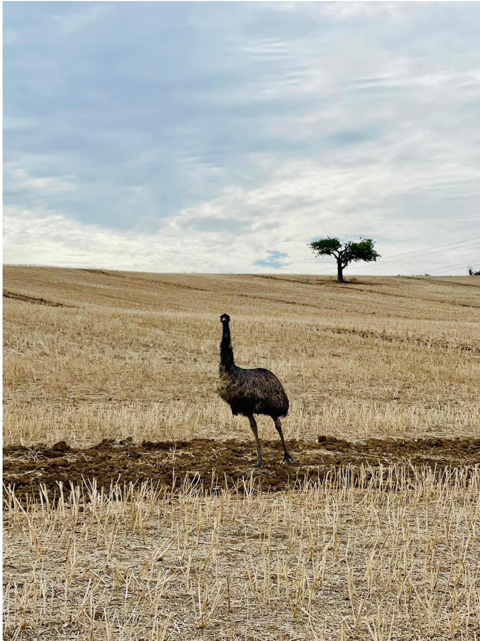
of Dugee, a rhea from Happy Pants Ranch

Compiled, edited and published for the village on behalf of St Margaret's Church