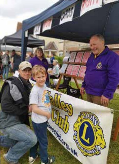
Photo: Play your cards Right – East Meon Country Fair May 2022 (permission given)

Help required! The Lions' Swanmore fete takes a lot of time and effort to plan and we need dozens of people to help us make the event work on the