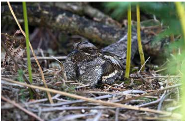
The ground nesting nightjar boasts extraordinary camouflage

Many of our ground nesting birds are in worrying decline, including nightjar, woodlark, lapwing and woodcock. As well as habitat loss and climate change, one of the main threats these rare species face is from disturbance.