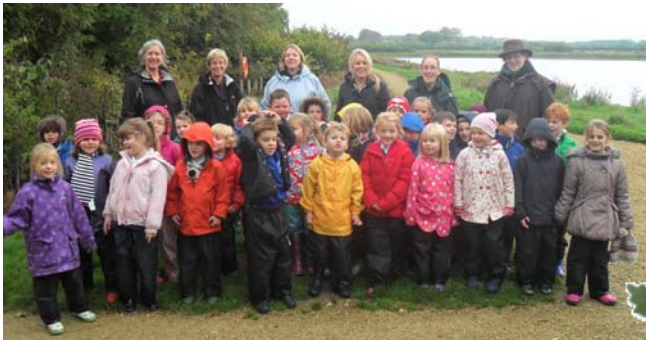
Photo shows Class 1 at Rushy Common.

Part time administrator required at Stanton Harcourt Primary School. email office.3130@stanton-harcourt.oxon.sch.uk