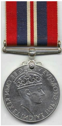
Left: War Medal 1939 – 1945