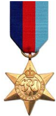
Right: 1939 – 1945 Star