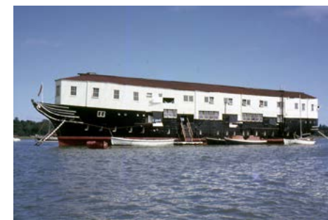
TS Mercury/HMS Gannet in 1968

established in 1978, 10 years after the closure. Sadly, with ever decreasing numbers able to attend reunions and serve the committee, we are formally winding up the Association and our last reunion will be in September. A major part of this will be an event in Hamble on Saturday 22nd of September. This will begin at around 11am when we will march through the village to St Andrews Church accompanied by the local scouting organisations and Hamble Pipe Band. After a short memorial service, we will formally present our model of the ship, as she was in our times, to the village to be displayed in your new Community Hub and Library. We are hugely proud to learn that this building will be named after Mercury. After our reunion, we will be presenting our cups, trophies and bass drum to Hamble Sea Scouts. Importantly Lord Baden Powell, a friend of C B Fry, launched the Sea Scout movement at Mercury in 1909 and your local troop retains the name Mercury.