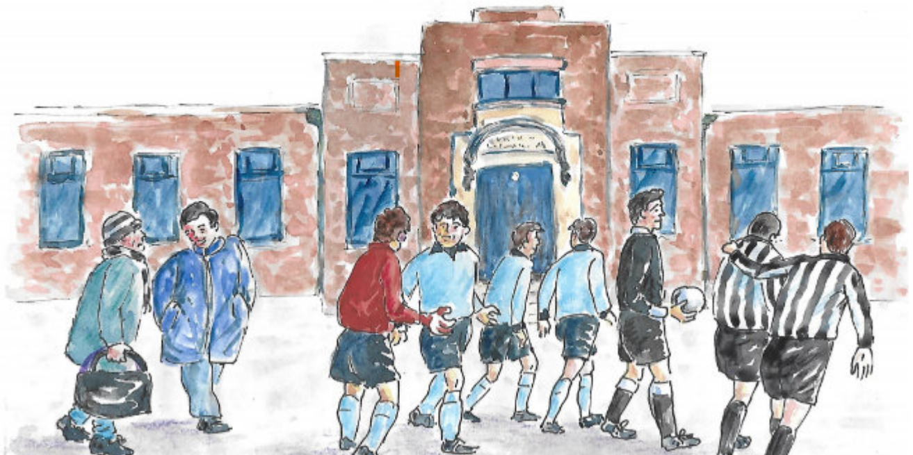
Players at Washington Welfare Hall

On the playing side, training and coaching sessions took place on one evening each week pre-season and into the early weeks of the season as light permitted. Indoor facilities at Usworth Comprehensive School were, somehow, negotiated. All such sessions led to a steady improvement in the number of boys wanting to be involved and in the standard of football being played each year.