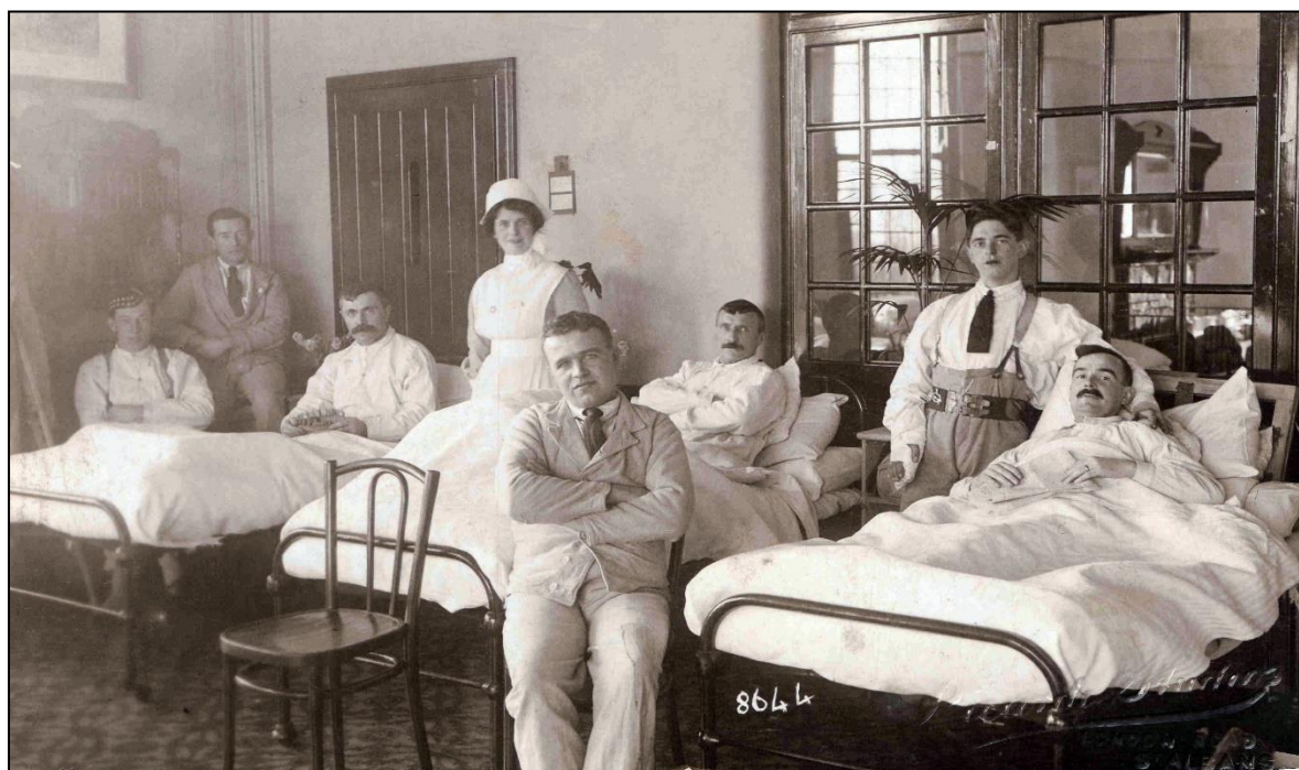
Above & below: patients on a ward at Napsbury, 1917