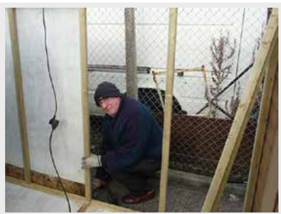
Not before some tricky fastening was done.