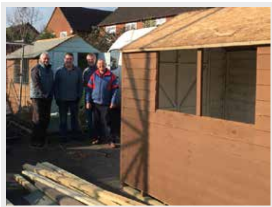
22 January 2017. 2nd shed up!