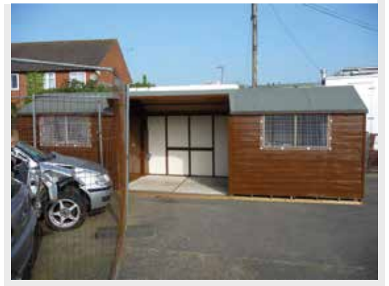
The practice cars could use the same TLC! Meanwhile we have plenty more to do inside.