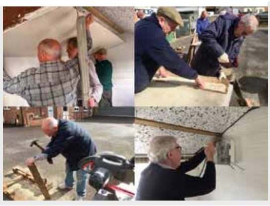
10 March. Electricity - hurrah! This shows what amazing progress has been made.