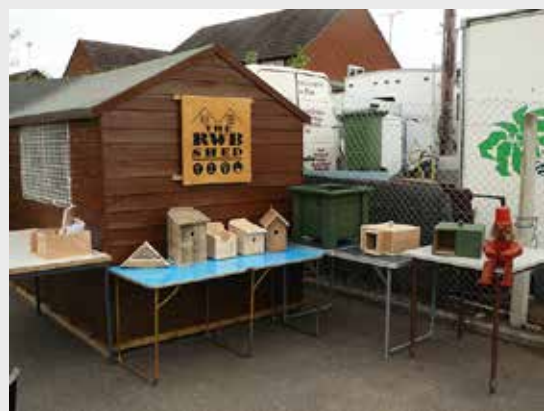
Display made ready.