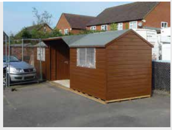
6 April. The RWB Shed - finished. The quality of the finish is like brand new!