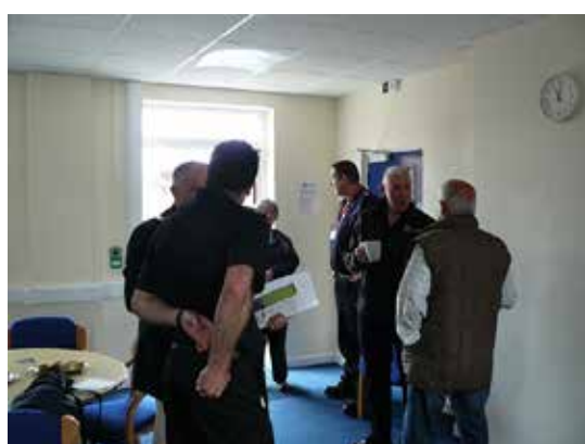
It was great to retire to the Hall when we fancied a cuppa tea.