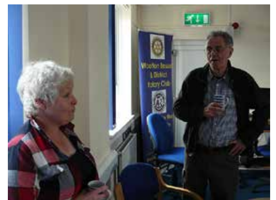
Meanwhile indoors tea and cake fueled more worldly discussions...