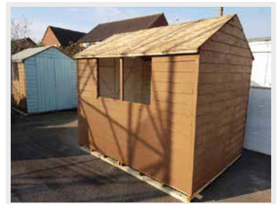
Shed 2 - for want of a better name!