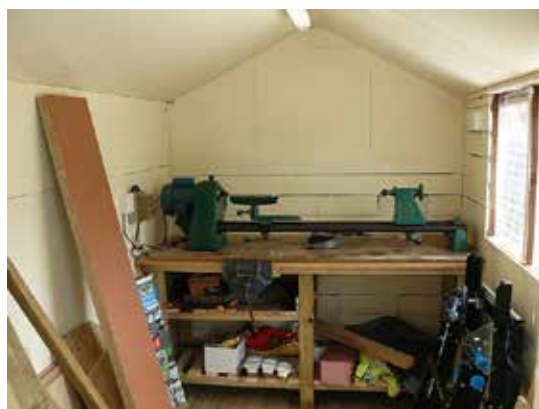
Shed2 - some plans are still afoot!