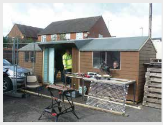
New faces popping up everywhere today!