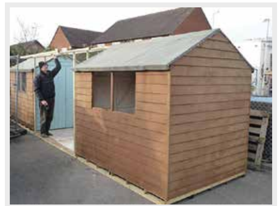
At the end of the day it all comes together.