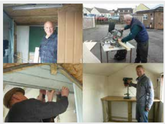
23 March. Shed 1 gets finished off as Shed 2 starts coming together.