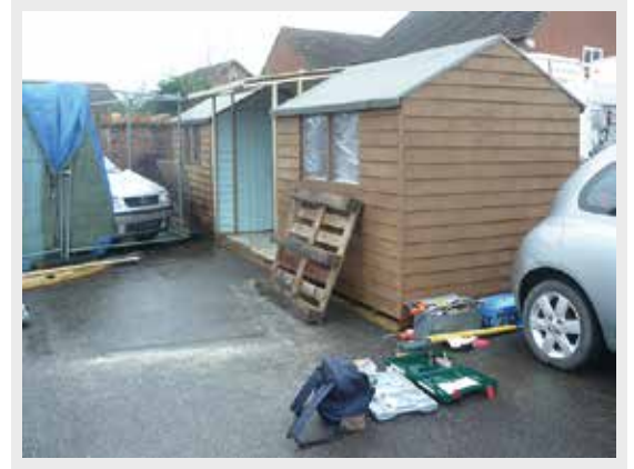
Plastic sheet for window as temporary measure.