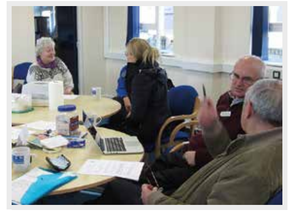
Launch Day, 1 December 2016. The discussions were many, with 18 members signing up.