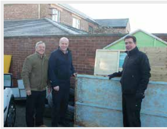
We pry apart the frozen panels to find only the ones that need painting.