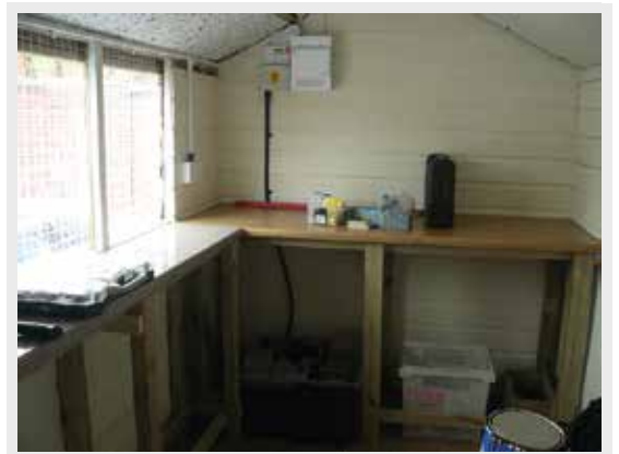
Shed 1 is almost ready for action making all the wood-work projects we have planned!