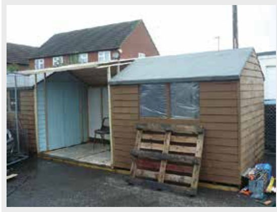
2 Feb. Decking roof done in time for storm.