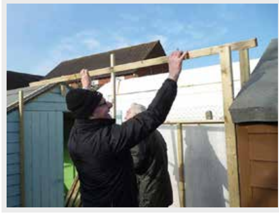
No gloves, what a brave man!