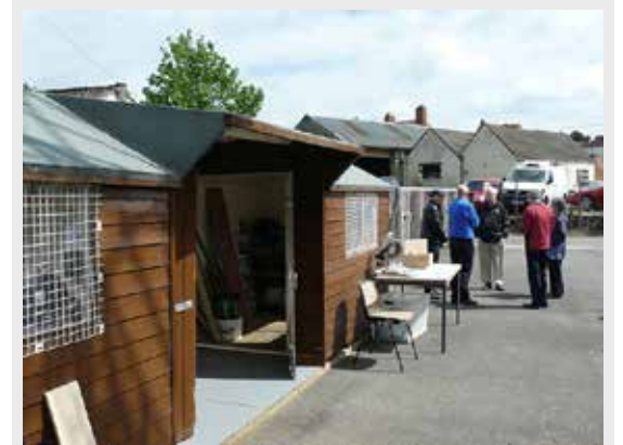
The Sun shines briefly!