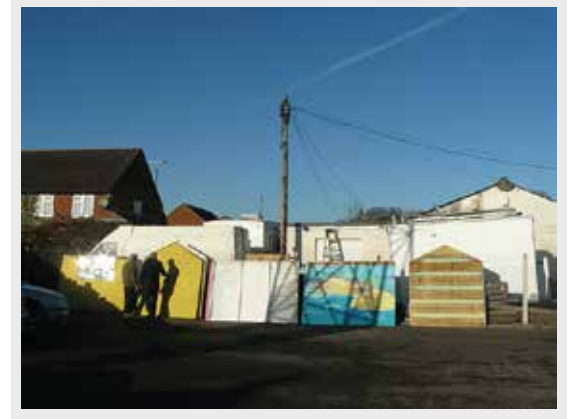
Spread out they drew attention from the road, so we moved them all to the left later.