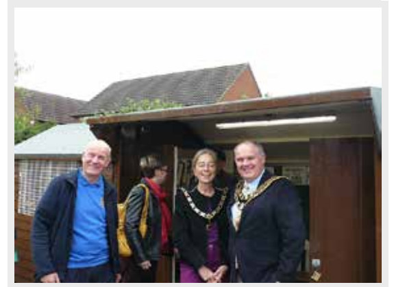
Mark with the Mayor and Mayoress. We also had over five visiting public that day.