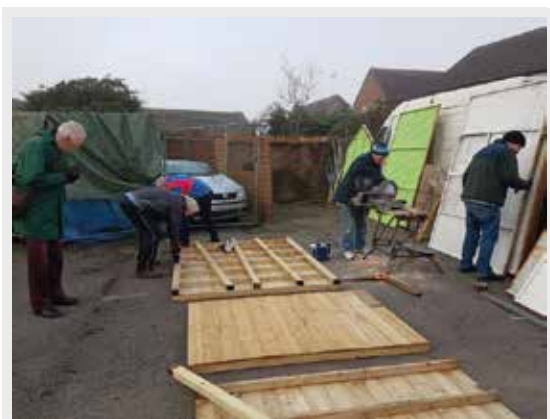
19 January 2017. With Dave Gardner's guidance we all had a job to do.