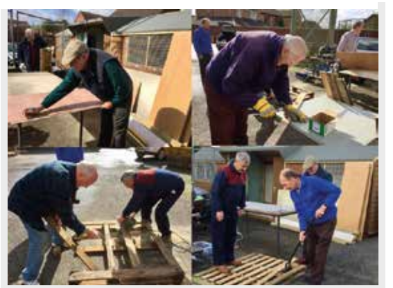
This excellent tool (bottom right) is purpose made to dismantle pallets - clever hey!