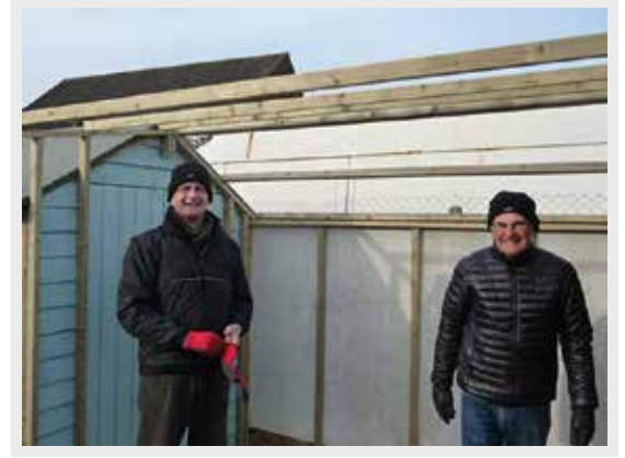
The vestibule frame and rear wall are up.