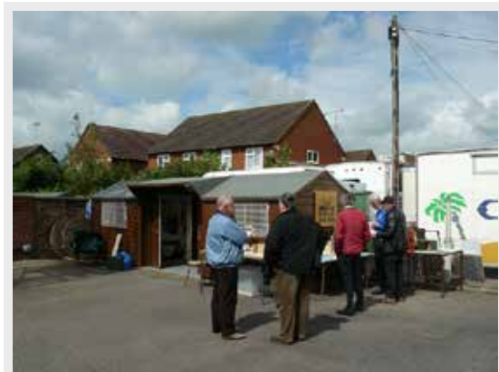
Blue sky appears but we're too busy chatting!