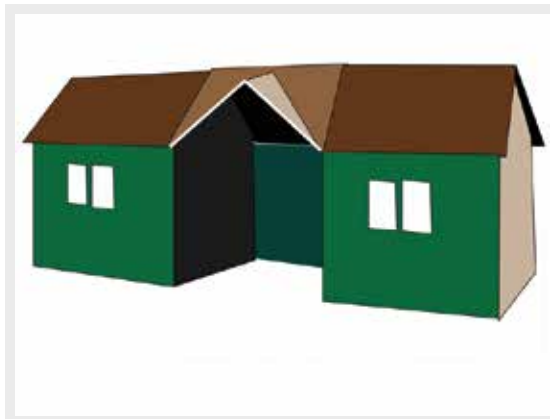
This was one idea for the vestibule area.