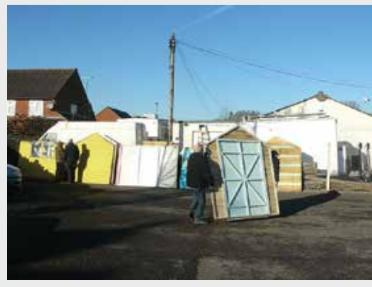
Over to the sunnier side of the carpark to dry the frost of before we paint them.