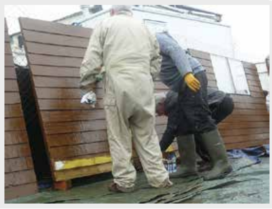
7 January 2017. We all got stuck in, a real team effort, so it went really well.