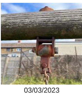
Item - Repair/s - Moderate - Task