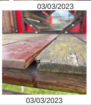
Other / Miscellaneous - Task