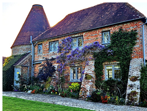
The gardens at Limekiln Farm in Chalvington are open for the National Garden Scheme on Saturday 18th and Sunday 19th April from 2pm to 5pm. Homemade teas, plants for sale, talk about medicinal plants in the Physic Garden at 3pm. Dogs on a lead most welcome.