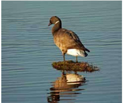
Brent Goose

Across the country, The Wildlife Trusts are still fighting against developments that put important wild areas at risk. For example, here in Hampshire, the Trust is currently fighting