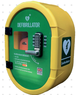
DefibSafe2 cabinet – latest model shown here.