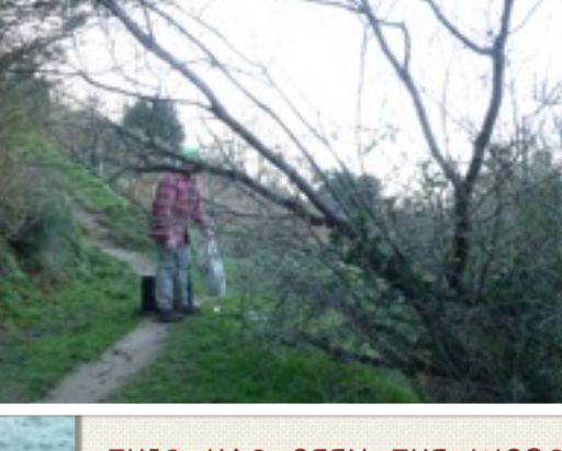
THIS HAS BEEN THE WORST WINTER FOR YEARS FOR STORM DAMAGE ON THE HILL. WE LOOK AT THE IMPACT ON THE HILL.