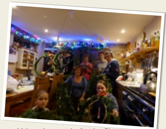
Making the wreaths for the Christmas tree on the hill.