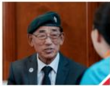
Welfare advice and guidance