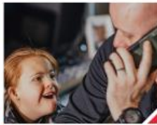
Signpost to mentoring and other SSAFA services

SSAFA understands that behind every uniform is a person. We are here for that person and their family - any time they need us, in any way they need us, for as long as they need us.