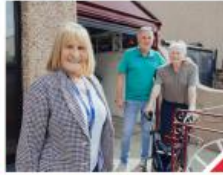
Veterans, including National Service