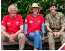
Support for our reserves