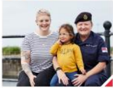
All military families