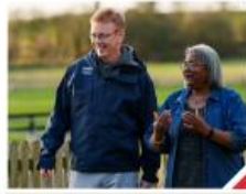
Practical and emotional support