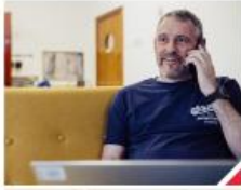
Non-judgemental and friendly advice