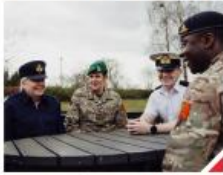
Service men and women