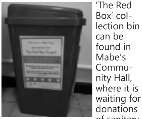
The Red Box can be found at the top of the steps in the Community Hall lobby

donations of sanitary towels and tampons. Once filled.