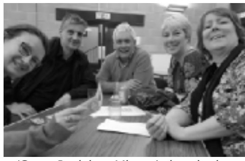
'Come Back in a Minute': the winning team

The MYCP's Quiz Night with a Cornish theme at the Community Hall on Saturday 2nd March was a lot of fun for all who attended.