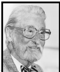
Dr Seuss (1904 – 1991)