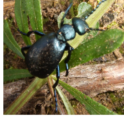
I'm rare, what am I?