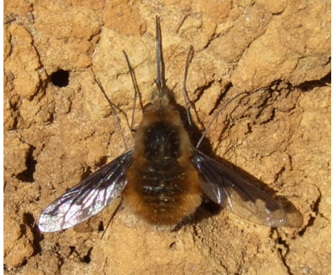
We are not bees. What are we?