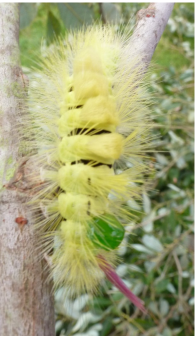
What type of insect is this?