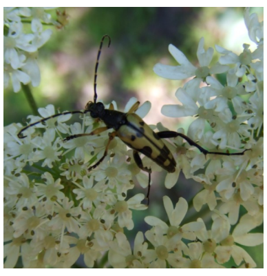
I'm common, what am I?