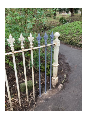
Replacement railings ready for painting

The only thing left to do is to paint both the railings and the gate which we are hoping to do at our work party on 14 April (weather permitting), working alongside some of the Parks and Gardens Team, who have done such a great job with the repairs.