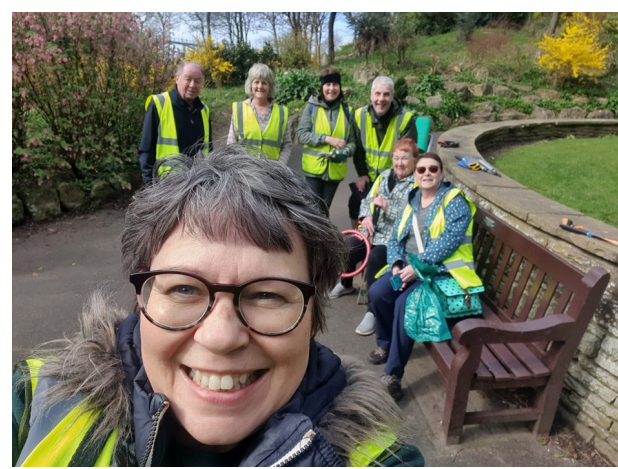
Pruners hard at work