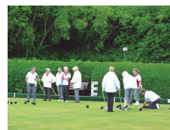
Flat Green Bowls