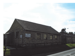
Swinton Reading Room And Community Hall

We are still looking for a solution to moving the snooker table from the Reading Room as it appears the second hand sales market is not good. Ideally we would like to find a good home for it and some return. Any ideas? Contact Dianne.