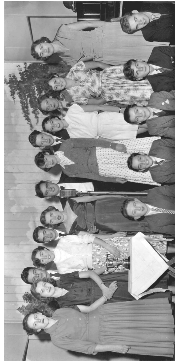
Another YFC prize giving night at West Felton village hall

PLEASE QUOTE REF 002 ON YOUR FIRST ORDER TO GET YOUR NEW CUSTOMER PACK