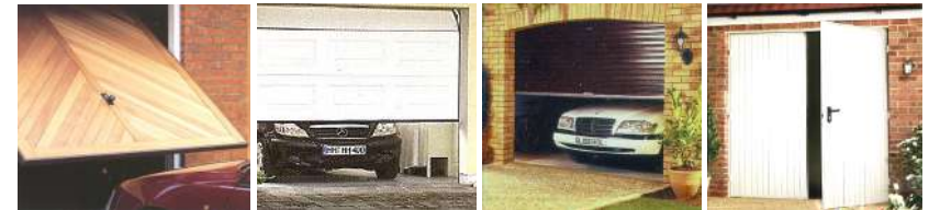
Up and over