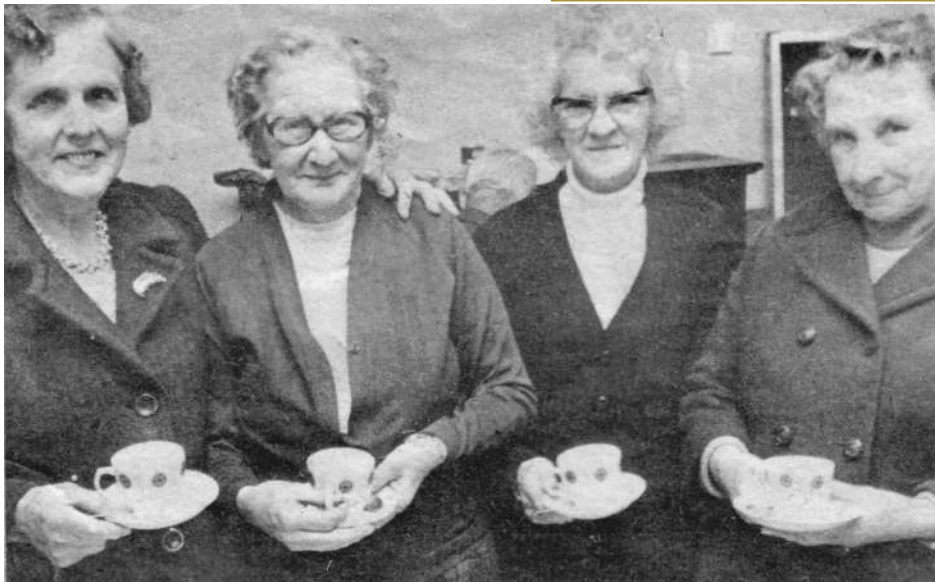
11 April 1977