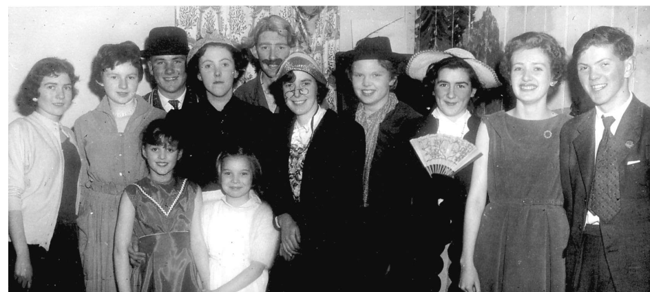
Here we see the West Felton group who took part in the YFC Top Club competition which they organised on Tuesday, 9 December 1958. West Felton were placed second.

From 1951 to 1965 West Felton had a very successful YFC.