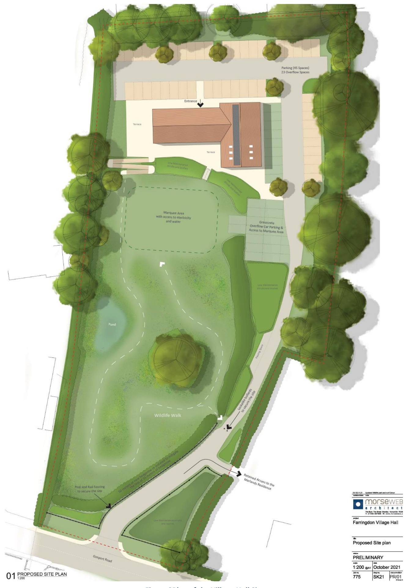
Figure 3Plan of the Village Hall Site