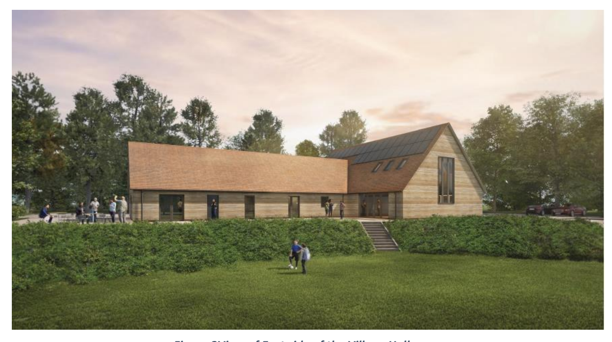
Figure 2View of East side of the Village Hall