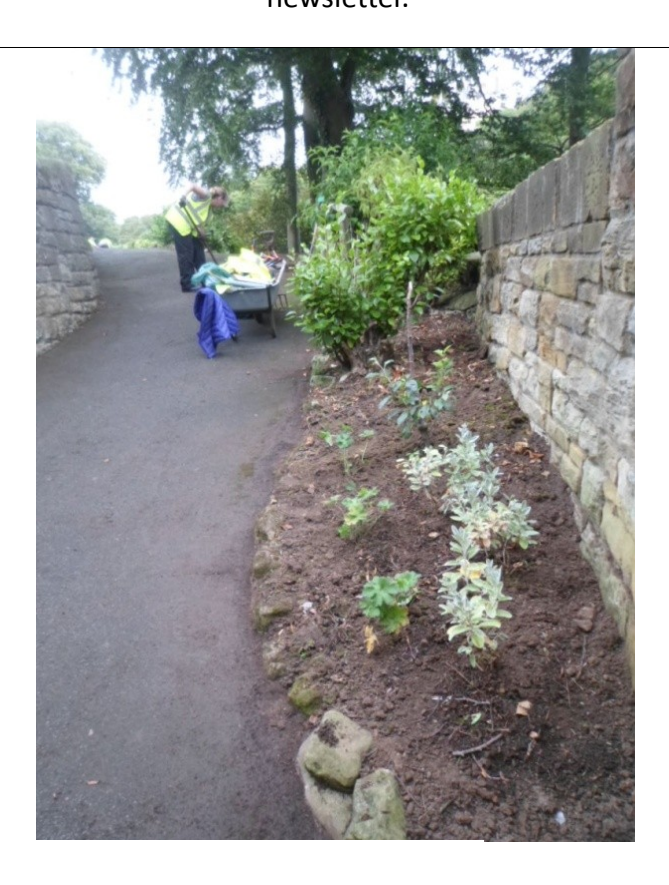
Planting up the new border

Further details about these events elsewhere in the newsletter.