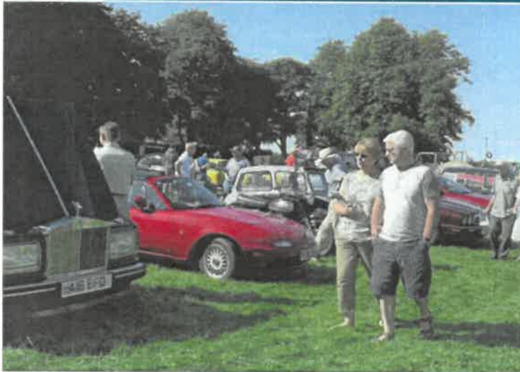
Classic car and family fun day at the Swaffham recreation ground 'Some of the many cars lined up on display at the show'

Home News Sport Lifestyle What's On Jobs Subscribe Advertise Contact