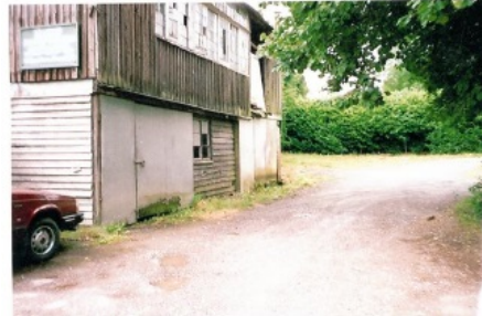
Timber yard site demolished and became store & post office site 1971 [be]