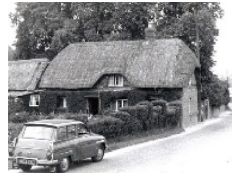
Hurst Cottage [pc]