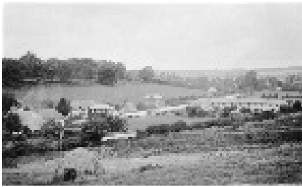
The Dene looking north with The Rank cottages [pc]