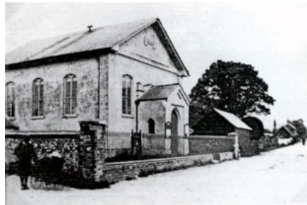
Congregational Chapel c1920