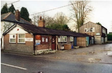
Village Post Office & Yard April 1974 [be]