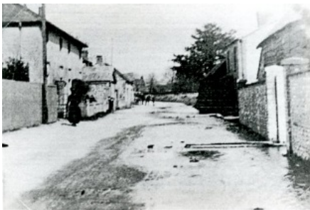
Floods in the Dene - c1910