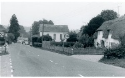
The Dene looking south 1960's [pc]