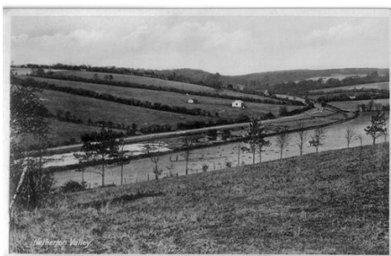
Netherton Valley Road - 1940's