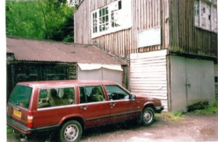
Timber yard site demolished to become site for store & post office 1971 [be]