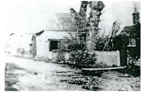
Flood in the Dene