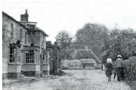
The Coopers Arms c1900