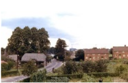
The Dene with The Crescent prior to construction of Dean Rise [pc]