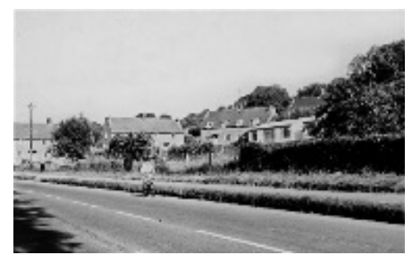
The Crescent prior to construction of Dene Rise [pc]