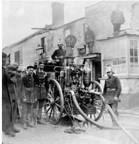
Coopers Arms fire 1904 [tw]