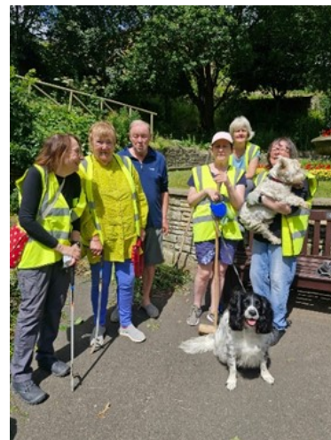
Tackling the undergrowth on the top border